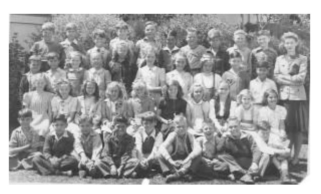
Corcoran Class Photo - 1942

Voters of the elementary school district gave overwhelming approval at a special election held in October 1950 for the expansion of the school building program by authorizing the issuance of $500,000 in bonds and the acceptance of a loan of $2,200,000 from the state. Superintendent A.R. Beardsley singled out the Citizens Committee headed by Fred Carroll as a contributor to the largest turn out of voters in the history of the school district. The vote was four to one in favor of the proposals. The money from the bond and state loan was to be used to construct a new seventh and eighth grade school; to replace Central school; to erect a new building at a new site near the Corcoran Airport; to make additions to the Fremont and South schools; and to build a new administration building.