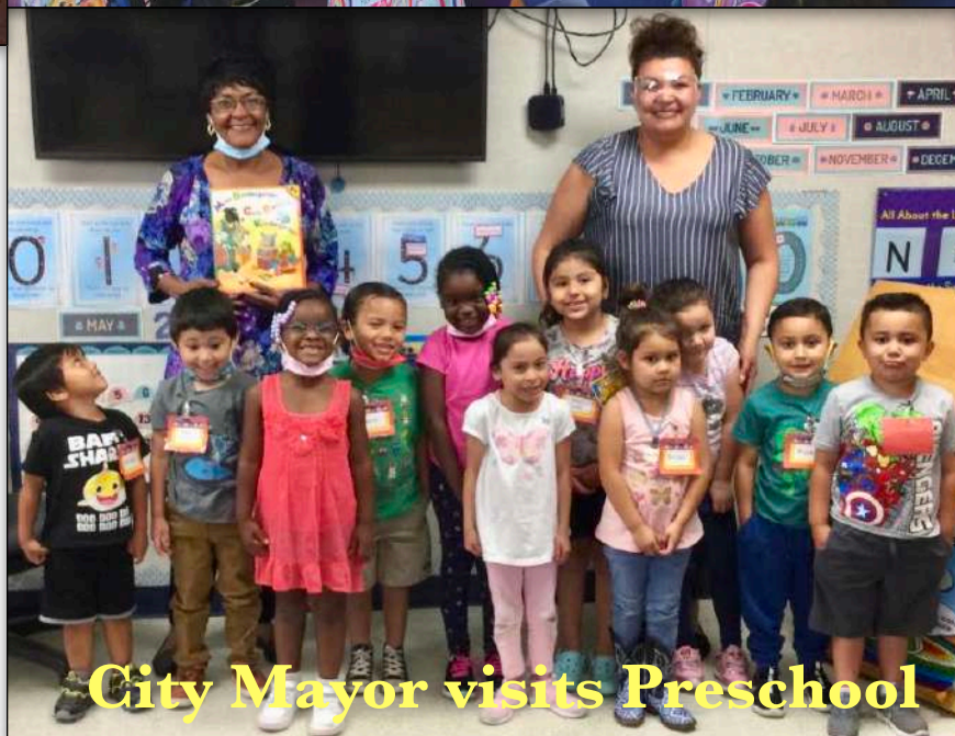
City Mayor visits Preschool