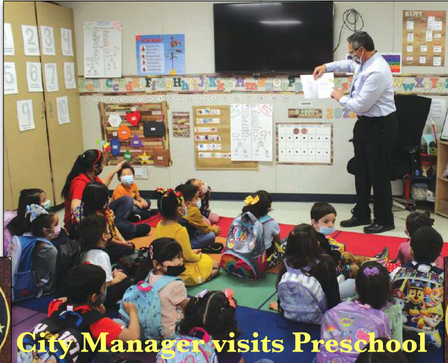
City Manager visits Preschool

A Destination District where people are drawn to Corcoran due to the quality, reputation, and impact of accomplishments of our students and schools on the COMMUNITY .